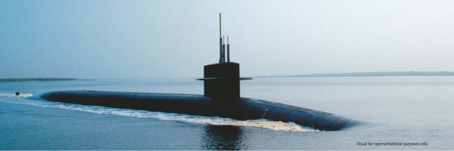
Visual for representational purposes only.