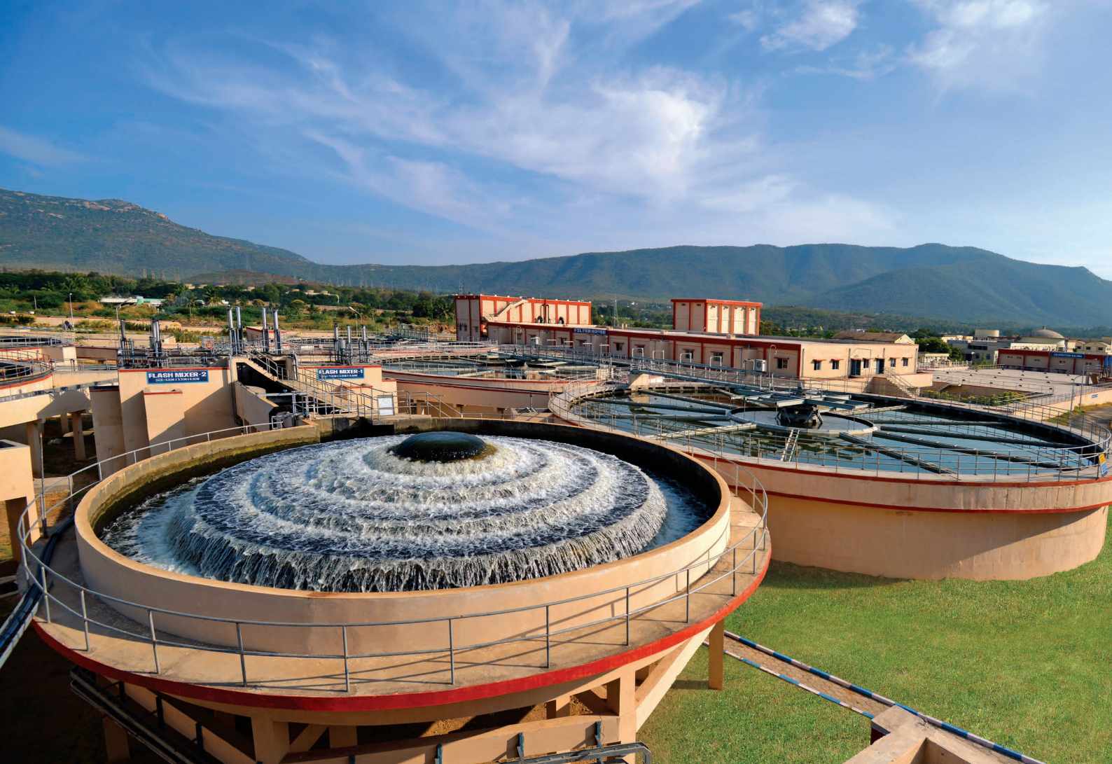
181 MLD Water Treatment Plant for Vellore Water Supply Scheme. L&T has extensive experience in the design and construction of structures for water, industrial and waste water treatment, transmission and distribution.