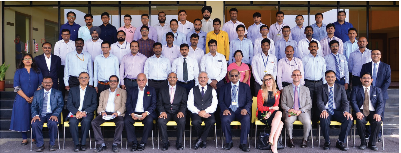
Batch 1 of Postgraduate Certificate of Master's Program in Business and Project Management with SDA Bocconi, Milan, Italy