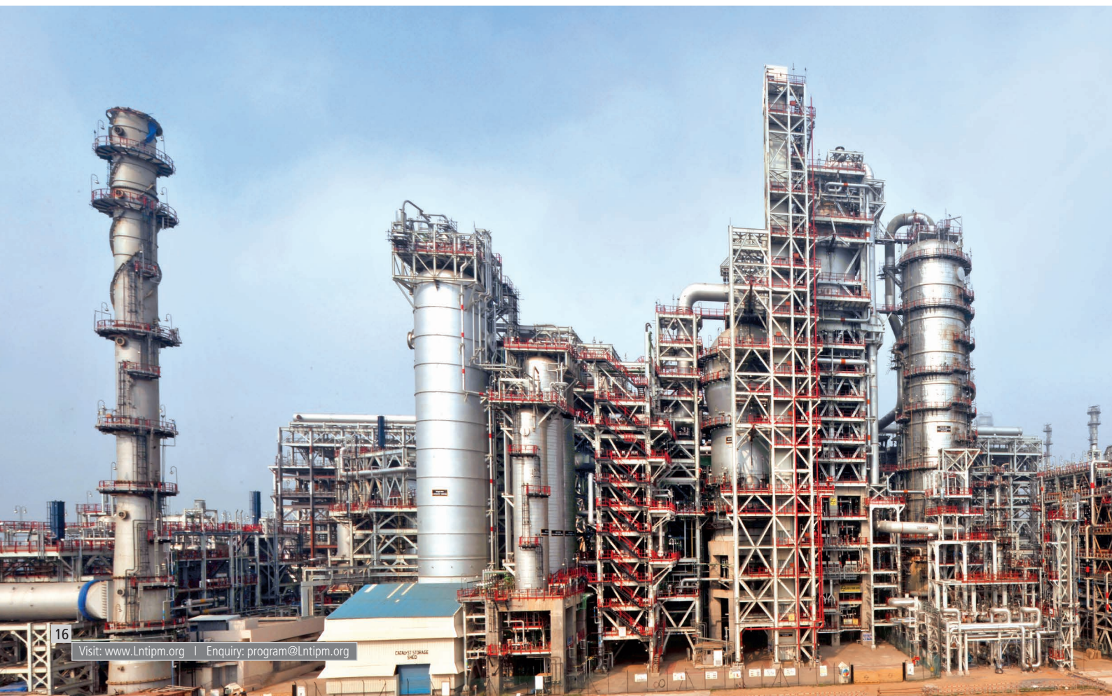
FCC Reactor regenerator section (INDMAX) for IOCL at Paradip Refinery (Capacity: 4.17 MMTPA)

Each project brings with it challenges and learnings that are unique. Aligning with the charter that our cases for discussion in the classroom are also drawn from the experiences of past projects and lessons learned from L&T Projects, case studies with factual data are used to create the knowledge base for future managers. From this perspective, case studies are an excellent source of reference in the area of project management. L&T IPM encourages senior participants to write case studies as part of their long duration programmes. More than 18 cases have been written in in the past. The published compendium covers cases across L&T businesses like L&T Construction: Infrastructure Roadways, Heavy Civil Infrastructure, Buildings & Factories, Water & Effluent Treatment (irrigation) as well as Power and Ship Building projects, recently executed.