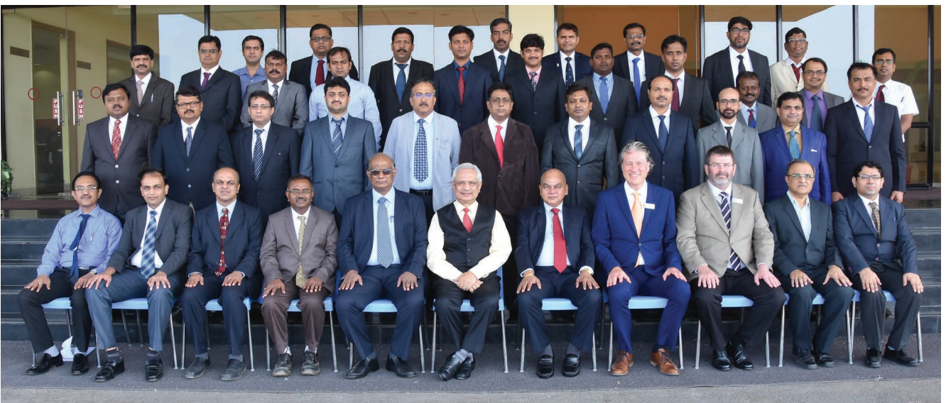
Batch 1 of Advanced Programme for Excellence in Project Execution with Cranfield School of Management, UK